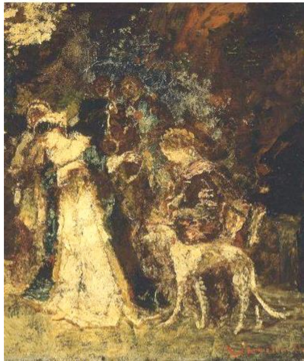
Figures in Renaissance Costume (detail) Adolphe Joseph Thomas Monticelli

She was quite a small girl, no more than five feet in height, if that; and she had that peculiar rounded slenderness which gives a deceptively fragile appearance. Her face was an oval of skin whose fine whiteness had thus far withstood the grimy winds of Izzard; her nose just missed being upturned, her violet-black eyes just missed being too theatrically large, and her black-brown hair just missed being too bulky for the small head it crowned; but in no respect did she miss being as beautiful as a figure from a Monticelli 18 canvas.