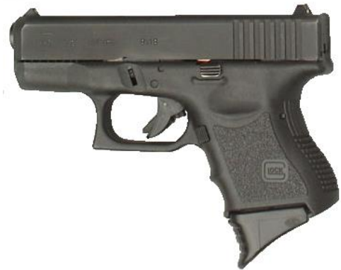
"snub-nosed automatic pistol"

Behind the counter was a girl in tan flannel-- the girl he had nearly run down twice the previous afternoon-- the "Vallance girl" who had refrained from adding to justice's account against Steve Threefall. In front of the counter, leaning over it, talking to her with every appearance of intimacy was one of the two men he had seen from the staircase window half an hour before-- the slender dandy 17 in gray who had slapped the other's face and threatened him with an automatic.