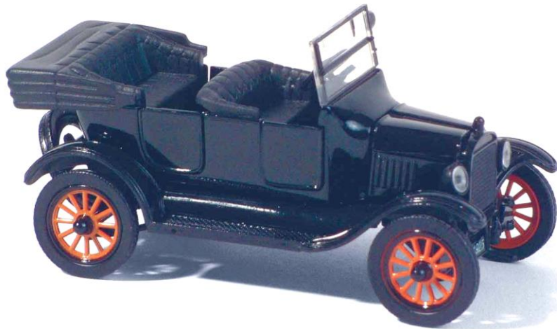
1925 Model T Ford

his gray eyes were bloodshot; face and clothing were powdered heavily with dust. One of his hands clutched a thick, black stick, the other swept off his hat, and he bowed with exaggerated lowness before the girl's angry gaze.