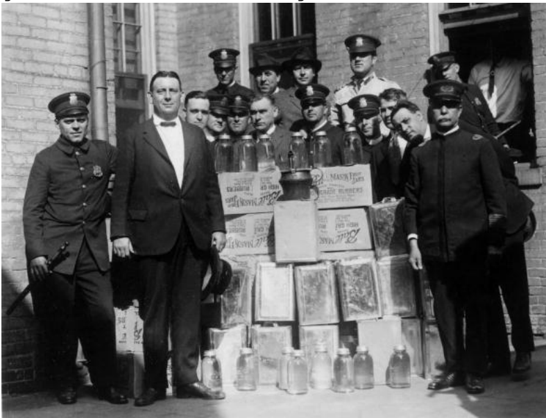
liquor seized during police raid

"There always is-- in Izzard," the marshal said enigmatically 25 as he got his bulk in motion again.