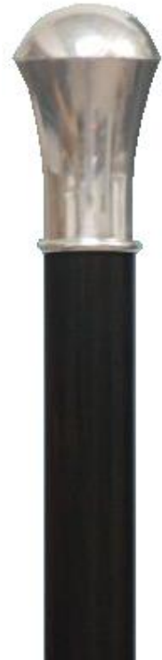
"loaded ferrule and knob"

Steve Threefall went down the wooden stairs toward the street in as cheerful a frame of mind as his body-- burned out inwardly with white liquor and outwardly by a day's scorching desert-riding-- would permit. That justice had emptied his pockets of every last cent disturbed him little. That, he knew, was the way of justice everywhere with the stranger, and he had left the greater part of his money with the hotel proprietor in Whitetufts. He had escaped a jail sentence, and he counted himself lucky. He would wire Harris to send him some of his money, wait here until the Ford was repaired, and then drive back to Whitetufts-- but not on a whisky ration this time.