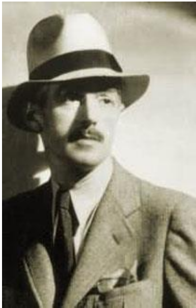
Dashiell Hammett 1894-1961

A Ford-- whitened by desert travel until it was almost indistinguishable from the dust-clouds that swirled around it-- came down Izzard's Main Street. Like the dust, it came swiftly, erratically, zigzagging the breadth of the roadway.