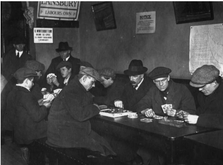
games of chance