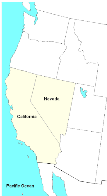
Western United States

The giant chuckled deep in his heavy chest, took the man in khaki by the nape 4 of the neck and an arm, and walked down the street with him.